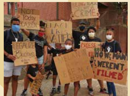
Social Action Committee