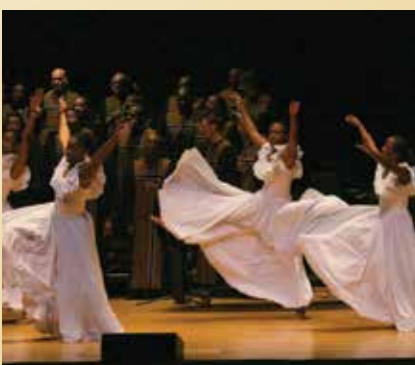
Amazing Grace Liturgical Dancers