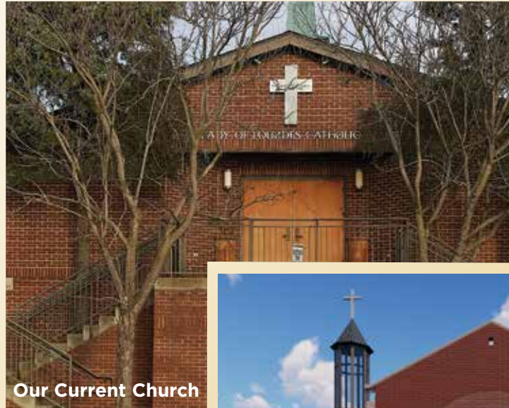
Our Current Church