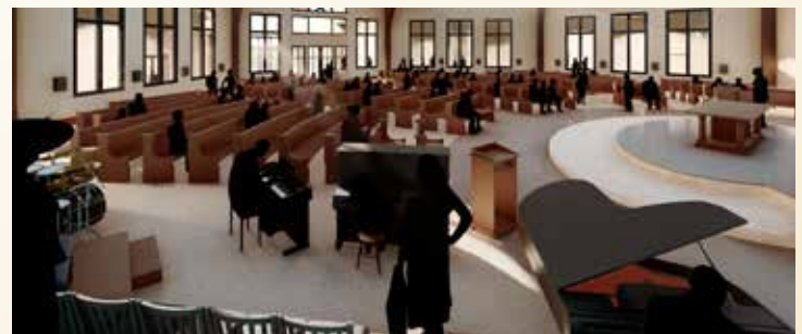
We will be able to enjoy our amazing choir from their new space.