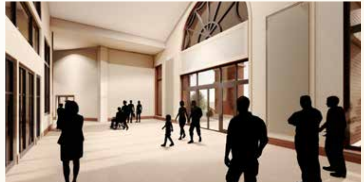
The larger Narthex will allow for greeting, socializing, and hugs!