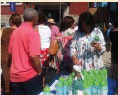
Life Issues Committee