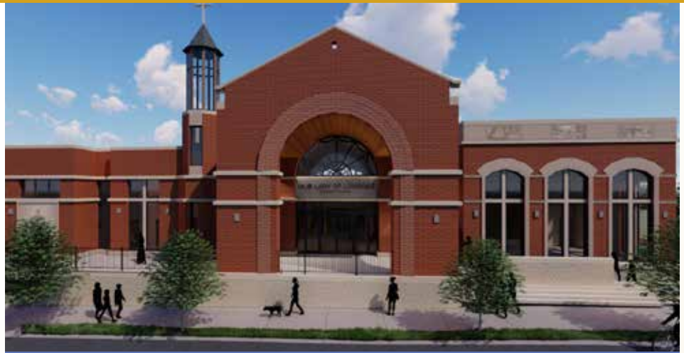
Our welcoming entry will face Edgewood Avenue. Across the street will be a new parking structure for our use.