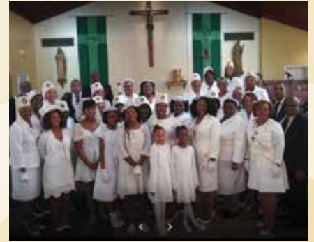
Knights of Peter Claver Family