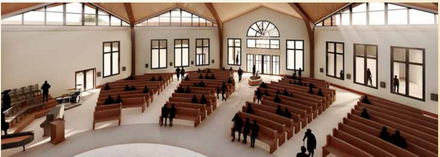
The new church will have seats for over 500 people—an increase of 250.