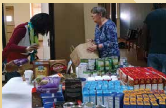
Society of St. Vincent de Paul