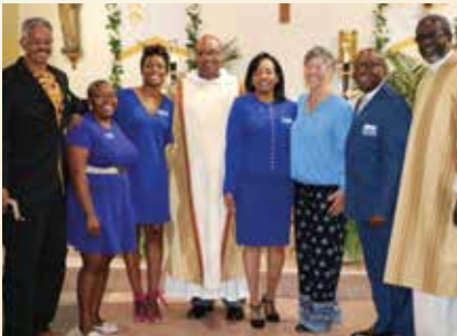
Stephen Ministry Leaders