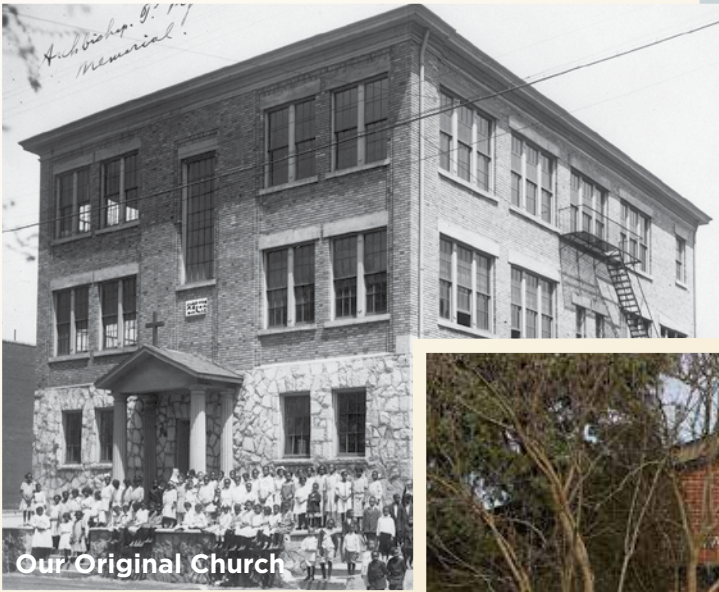
Our Original Church

Rooted in African-American Catholic history, Lourdes celebrates the Living Word, embraces inclusiveness, and inspires social action.