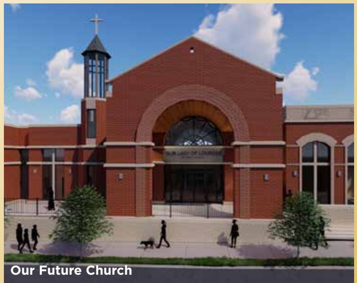
Our Future Church