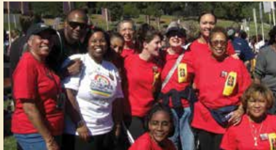
Simon's Call (AIDS Ministry)