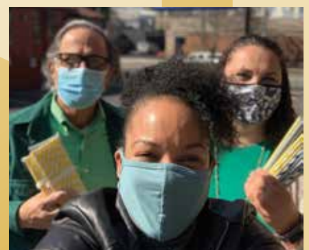
The Dream Green Team

we are active | we are committed | we are Lourdes