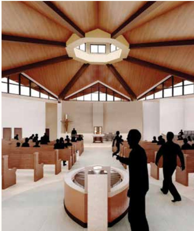
The baptismal font will be accessible to all as they enter the sanctuary.