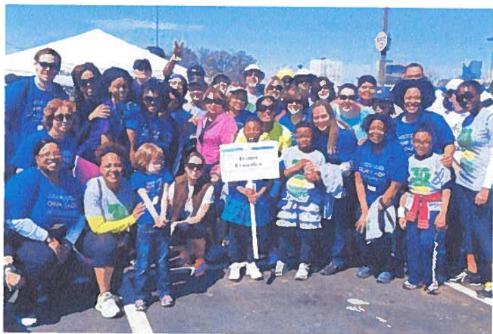
2014 - Hunger Walk