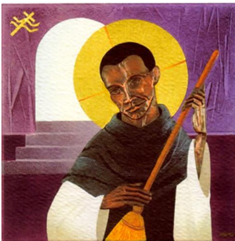
SERVING IN FAITH

St. Martín imitated our Lord Jesus who was “meek and humble of heart.” There was no pride or vanity in him. May we at Lourdes who assist and serve the poor and homeless do so with graciousness and gentleness of spirit. The Lourdes Pastoral Care Team and our Stephen Ministry embody our love for one another. We pray for more caregivers to come forward to be trained for this wonderful calling.